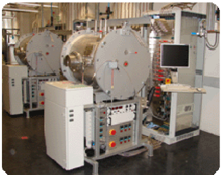
Test stand solution for MCFC-stacks