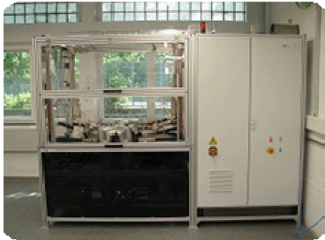
Test stand for EGR cooler modules